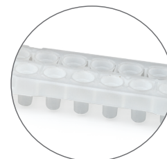
Single-use probe covers minimize cross contamination