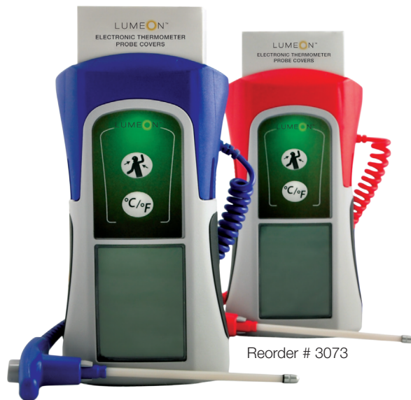
Reorder # 3073