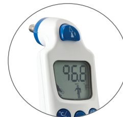
Easy-to-read LCD display